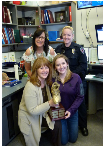
Team Jiggle Giggle

57 participants reported a total of 184.5 pounds lost over the 8-week program. Team Jiggle Giggle won the employee team challenge with a total weight loss of 50.4 pounds!