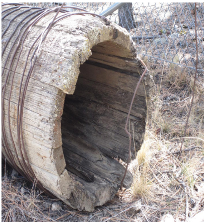
Original Wood Pipe

The water diversions that brought water to town were located in the headwaters of Ralston Creek. The Frog Pond galleries were made of stone about six feet underground and allowed fresh water to infiltrate into wooden pipe that carried the water to town. The 12-inch pipe was buried from the Frog Ponds to a stone reservoir above town where the Dory Hill Water Treatment Plant is located. A section of the 120-year-old stone reservoir is still