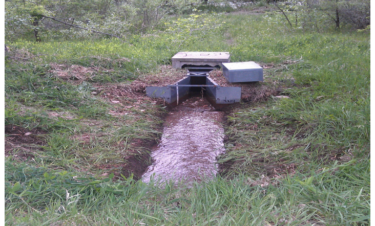
Church Ditch Augmentation Station

plants with water that is senior to the right that is in priority. We do this with Church Ditch water that we first purchased in