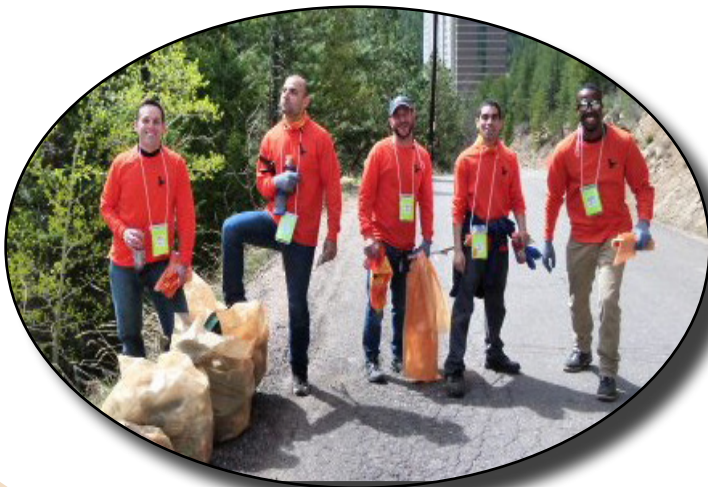
2017 Clean-Up Day Crew

Stay tuned for additional details regarding this annual event. As always, we appreciate your efforts in keeping our City looking spic and span throughout the year!