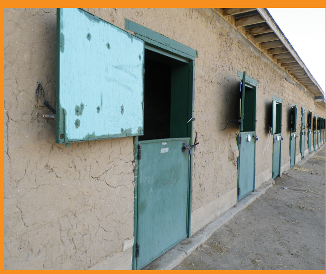
Adobe Stables

produce a documentary on the preservation project. The film showcases the history of the site as well as its relevance to the livelihood of the community today. Long enough to tell its story but concise enough to engage any audience, the 13-minute film includes interviews with community partners and local residents, all of whom express their passion for preserving the stalls and other parts of their local built environment. The film serves as a powerful marketing and outreach tool that advocates for the community even after the project's completion.