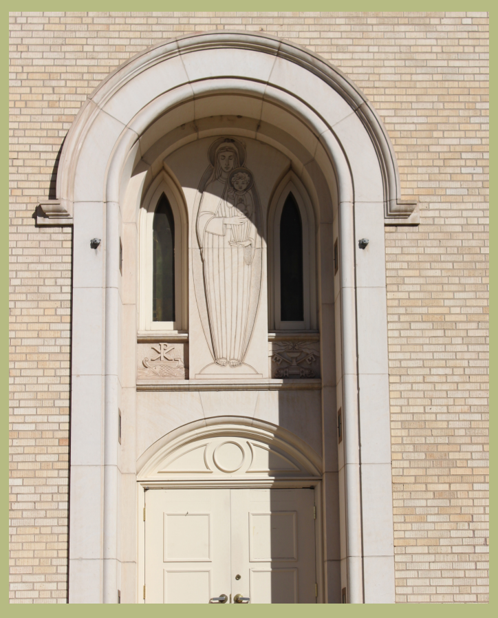
Eiler Heights

The City of Pueblo's proactive measures to document the area will prove useful should threats or pressures arise, as well as hopefully impart a deeper emotional investment in the longevity and future growth of the community.