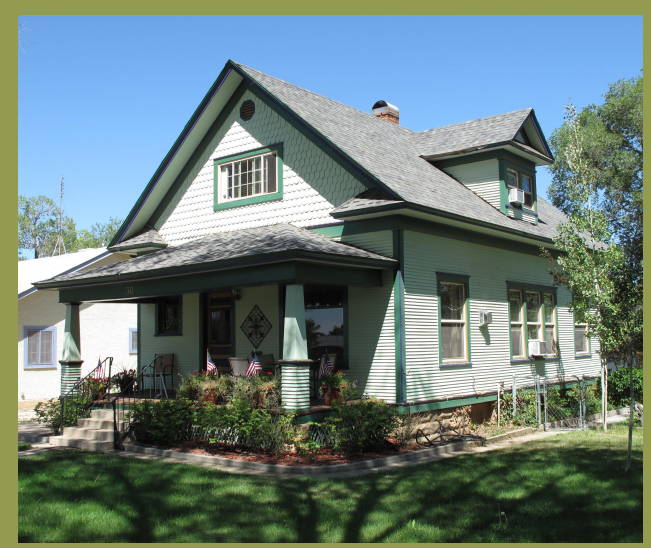
Montezuma Ave. Survey, Corte

The HPC is responsible for providing oversight and informal monitoring of historic properties and historic districts listed in the National Register of Historic Places. The commission is also responsible for recommending any property or district that has lost its integrity because of the demolition or alteration of structures for removal from the National Register.