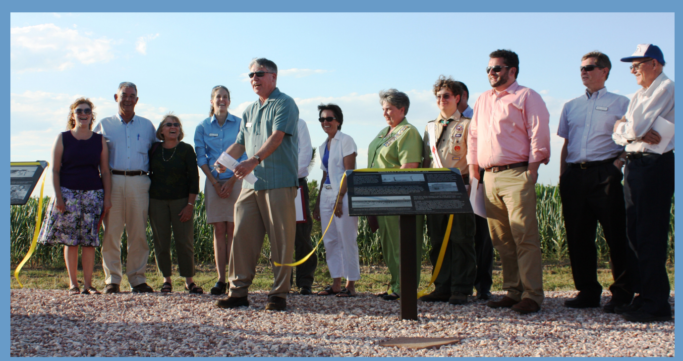
Greeley - Ribbon cutting ceremony for interpretive panels at POW Camp 202

In 2011, the City of Greeley used CLG funding to design, build, and install two interpretive panels commemorating the historic entryway into the former POW camp that held 3,000 Axis soldiers—many of whom worked on local farms or stayed in the area after the war. These panels offer Greeley residents and travelers alike an opportunity to learn and reflect about a local connection to World War II.