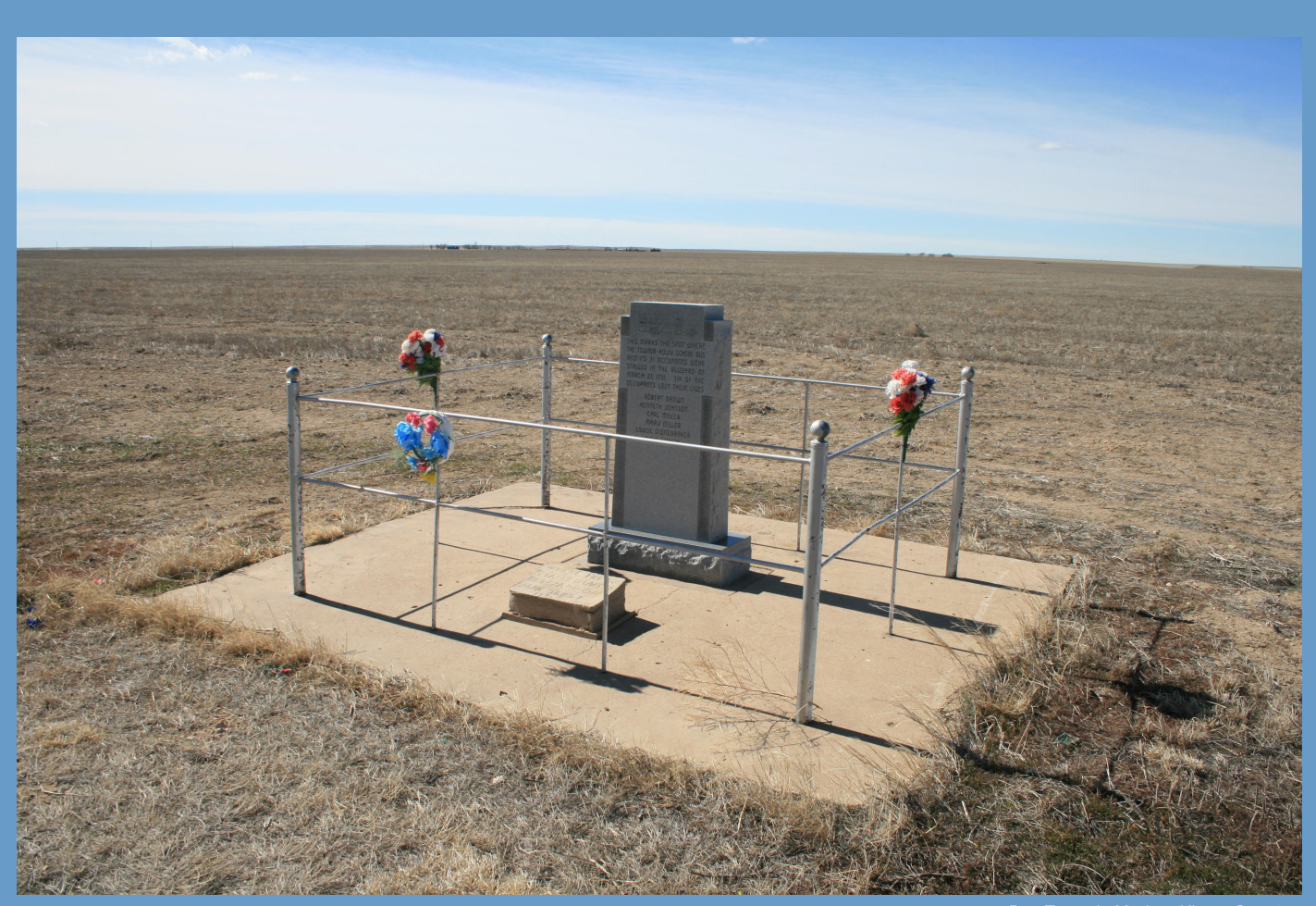
Bus Tragedy Marker, Kiowa County

Through preservation of both the physical site of the crash as well as the community's memories, Kiowa County can tell its story and honor the significance of a national tragedy.