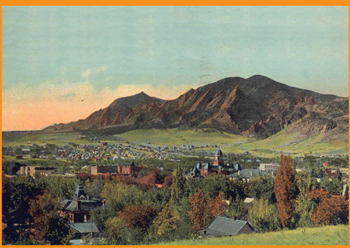
Historic Boulder

Using the newly created plan as its guide, the City of Boulder is embracing its future with definitive plans for addressing existing preservation issues and expanding the program to protect historic places, promote preservation as an ethic and methodology, and connect community members to each other.