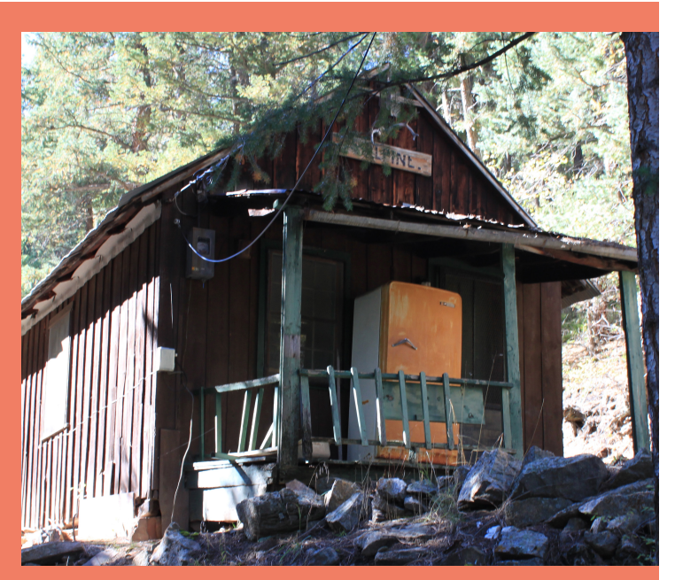
Fourmile Canyon, Boulder County

» How the CLG intends to assist the SHPO in closing out any projects that were using HPF grants.